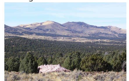
Red Canyon Drill Pad with Tonkin Springs in Background

Venture partners. We're hopeful that we will see some activity on the property before the end of the drilling season.