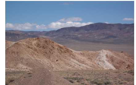
Redlich Project, located in Esmeralda County, NV

on. Rest assured that Miranda's exploration team has been working hard to get everything lined up for the 2006 exploration season.