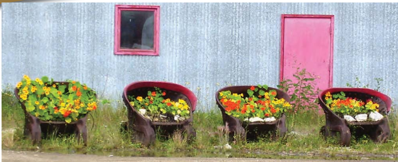
Buckets from one of Alaska's dredges now serve a new purpose.

I leave you with this last photo of Fireweed on the banks of the Copper River and the following quote from the end of Robert W. Service's famous poem "The Spell of the Yukon":